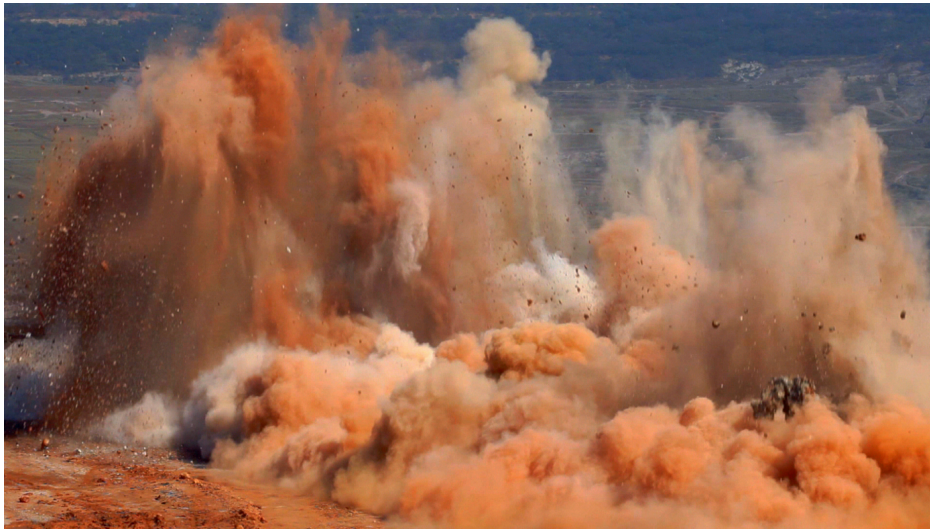
When Need Moves the Earth, synchronized 3 – channel video, 2014 ©Sutthirat Supaparinya

The highlight of upcoming exhibitions such as After Hope: Videos of Resistance, the video program under #MuseumFromHome and engage with art at a distance policy, the Asian Art Museum , San Francisco, USA [Open from Spring 2021] and The 10th Asia Pacific Triennial of Contemporary Art (APT10) , Queensland Art Gallery | Gallery of Modern Art, Brisbane, Queensland, Australia [27 November 2021 – 25 April 2022]. Recently, she is a fellow of the DAAD Artists-in-Berlin Program in 2021, the one-year artist in residence in Berlin, Germany.