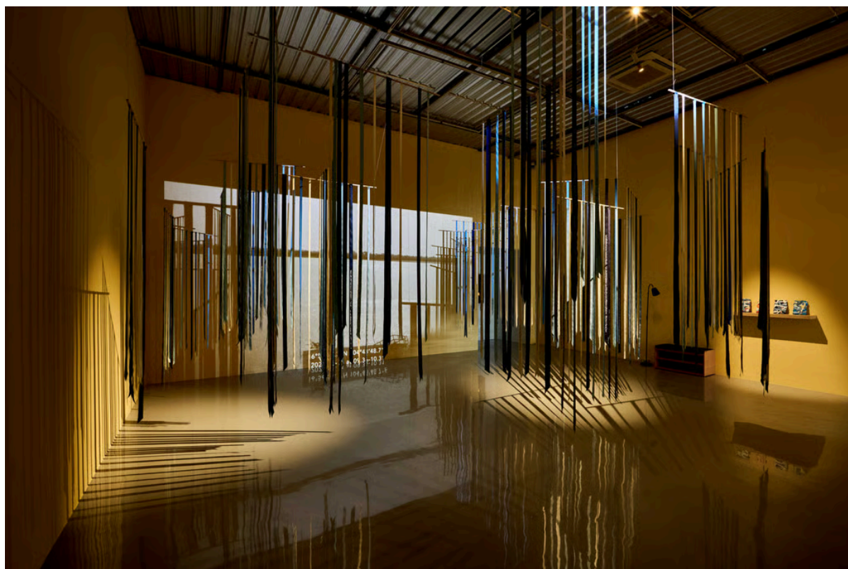
Collapsing Clouds Form Stars (2021), video installation, Som Supaparinya. The Thai artist's work will be shown at the Sea Art Festival in Busan, South Korea.

Hosted by the Busan Biennale Organising Committee, the Sea Art Festival is back at Dadaepo Beach after six years. Themed “Undercurrents: Waves Walking on the Water”, this year’s festival explores the hidden forces beneath the sea through installations, sculpture, video and performance. It will feature 23 artists (or groups) from around the world, including Chile, Switzerland and