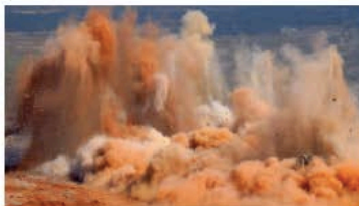
Sutthirat Supaparinya - Video still