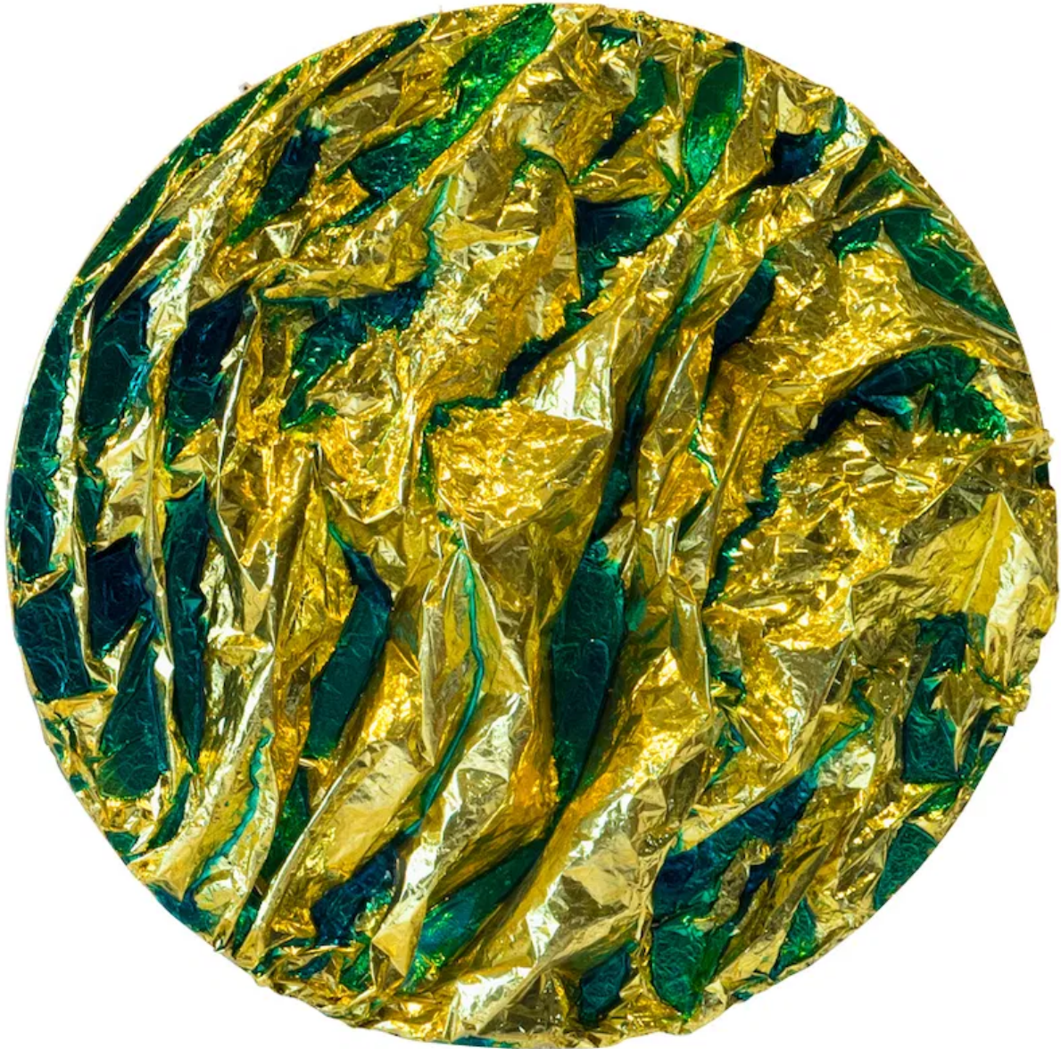
Tuan Andrew Nguyen, Nine Dragon River 2 (2017). Image Epoxy resin and survival blanket.

Also near the entrance is an installation titled Ten Places in Tokyo (2013) by Thai artist Sutthirat Supaparinya, for which an enclosed area was specially constructed. The work features video footage of the ten locations in Tokyo that reportedly use the most electricity in the entire city, which remains reliant on nuclear power despite the Fukushima disaster of 2011. The black and white videos seem innocuous until static consumes the black spaces, echoing the way in which nuclear explosions incinerate dark colored matter faster than light. The space is also suffused with an eerie red glow, as if making visible the hidden radioactivity from Fukushima, which undoubtedly affects Tokyo, regardless of how much the