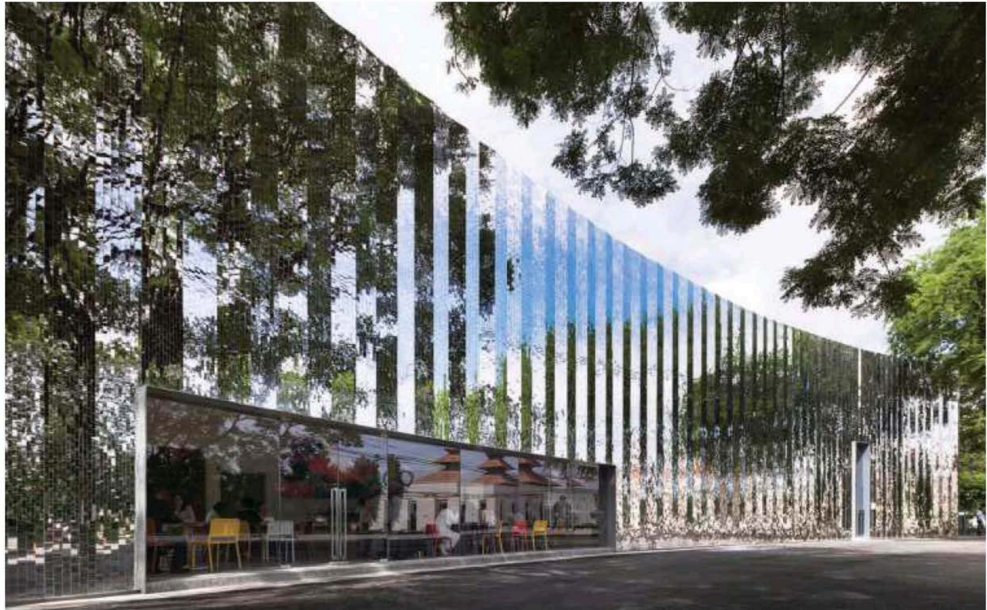
The one-year-old Mai Iam Contemporary Art Museum shimmers in the sunshine, adding even more vibrancy to Chiang Mai.

vate museums may not be for everyone but they're an important part of