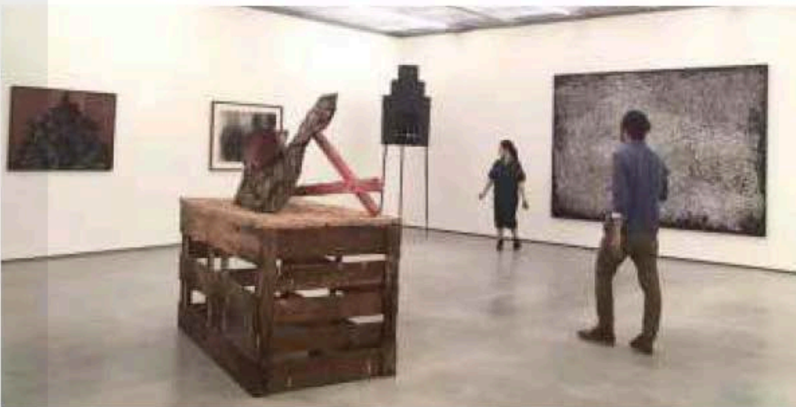
A sculpture by Thai contemporary art pioneer Montien Boonma faces an abstract painting by Rirkrit Tiravanija, right, at Mai Iam Contemporary Art Museum.

Chiang Mai Collection House to a museum to house works by leading local and international contemporary artists.