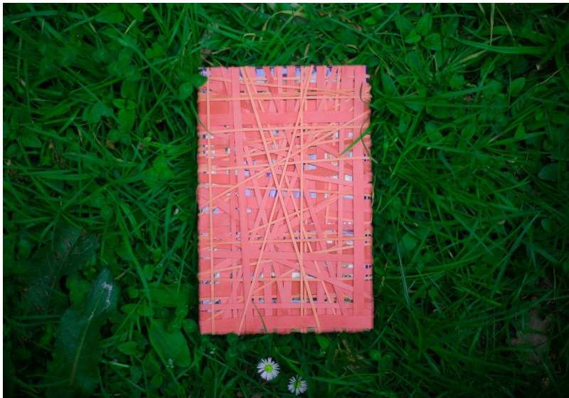
A picture from Sutthirat Supaparinya’s solo exhibition Steal This Book late last year in Wellington, New Zealand.

Books in the exhibition also include Pramodya Ananta Toer’s “All That Is Gone” (banned in Indonesia) and Noam Chomsky’s “Year 501: The Conquest Continues” (blacklisted by the South Korean military).