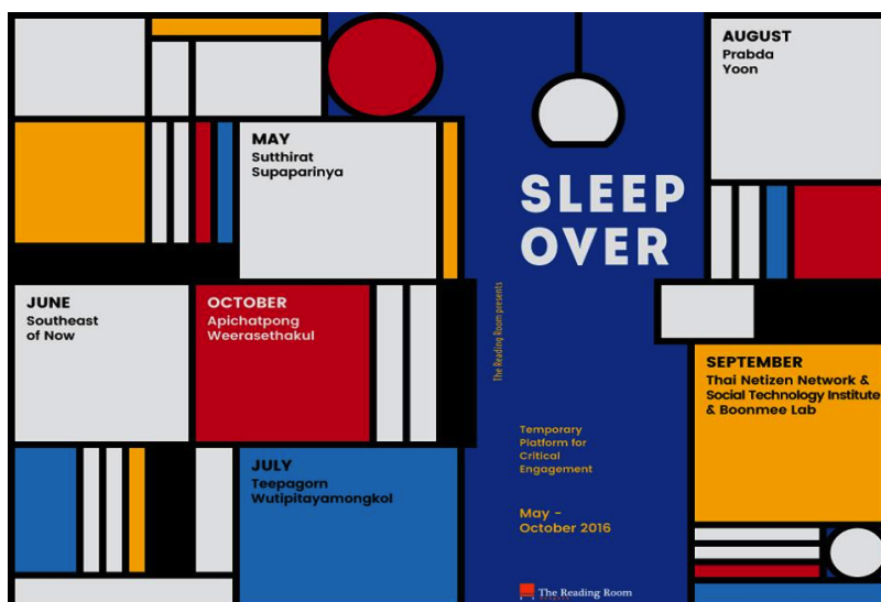
A promotional poster for The Reading Room’s Sleepover project.

The Reading Room is located on Soi Silom 19. Home to more than 1,000 books, it is open from 1pm to 7pm, Wednesday through Sunday.